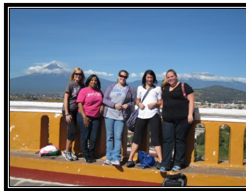
Student teachers in Puebla, Mexico.