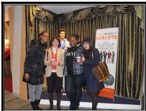
Student teachers with their Korean classroom teachers.